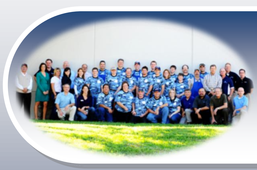
MRISA Warehouse Party & Fish Fry

Sept. 22 & 24, 2009 —Climate Master and Mechanical Reps held a technical presentation regarding water source heat pumps, their applications, designs, benefits, federal tax incentives, LEED points and how to deal with noise and maintenance concerns. With the new energy codes coming into affect (January, 2010) this may become a more popular option for owners.