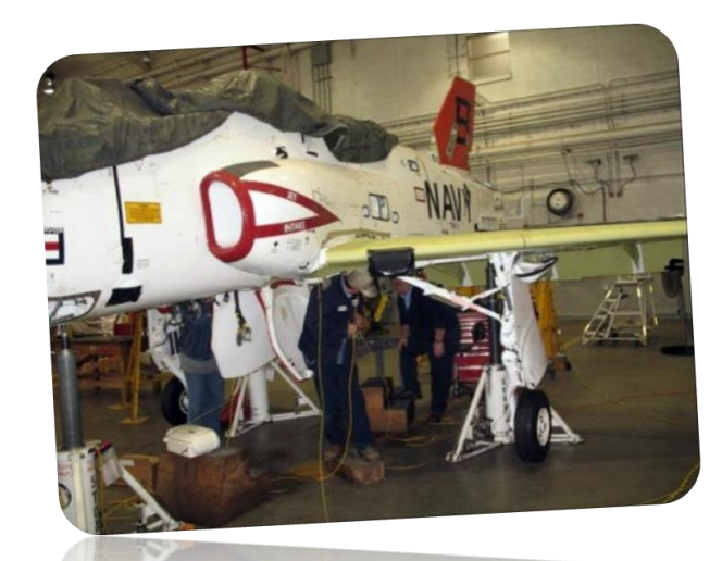
Naval Air Station Kingsville, TX

The Naval Air Station in Kingsville, TX has recently decided to renovate their Corrosion Control Facility that is located on base near the Gulf coastline. The Corrosion Control Facility is an approximately 140,000 sq/ft existing metal building where they provide the FLASHJET stripping and painting process of the United States Naval fighter jet fleet. The Boeing FLASHJET Process is designed to safely and economically remove aircraft coatings from both metals and composites without the use of hazardous chemicals or potentially damaging impingement media. It significantly reduces the amount of hazardous waste generated compared to chemical stripping or media blasting processes.