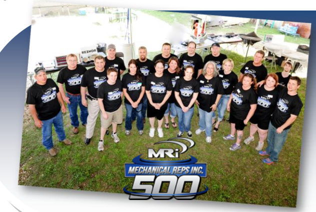
MRI Austin Warehouse Party

February 21 – March 2, 2012—XII in 2012 February featured the Greenheck Mobile Learning Center, which traveled to College Station, Austin, San Antonio, McAllen and Corpus Christi over a two week time span. Attendees witnessed the most comprehensive selection of air movement and control equipment in the world, learned about the latest advances in the industry, discussed their projects with knowledgeable Greenheck product engineers and received professional development hours for their participation.