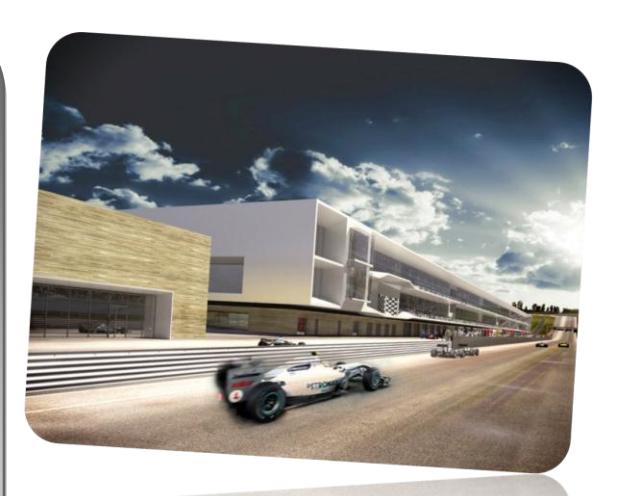
Formula 1 Austin, TX

Austin Commercial is the General Contractor on the project and is working with The Porter Company who is the Mechanical Contractor. MEJ & Associates, Inc. performed the MEP design on this portion of the project. Mechanical Reps, Inc. was selected to provide the equipment on the Pit Building – including ten Greenheck rooftop units with packaged DX cooling systems and electric heating coils, Greenheck kitchen exhaust fans, Greenheck and Price air distribution equipment, and Markel heating equipment.